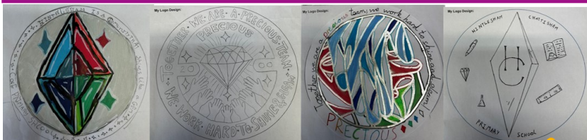
The four winning designs